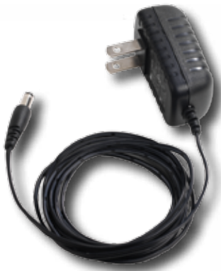
12V DC Power Adaptor