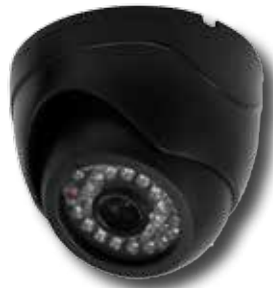
Camera - Ceiling Mounted

Select the position for the camera and secure the camera stand. Screw the camera onto the stand. Adjust camera to the proper view angle. Make sure the lens is upright relative to the subject. Tighten the thumb bolt. First Alert cameras can be either ceiling or wall mounted by simply reversing the camera stand mounting. See "Camera Orientation" Info box. Holes are provided on both the bottom and back of the camera housing to accommodate most mounting requirements. Run cable from camera to DVR location. See Information box below on "Longer Cable Runs".