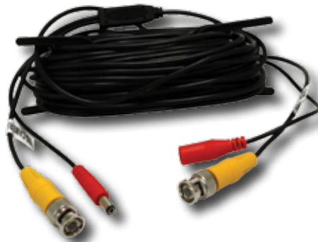
BNC Video & DC Power Cable