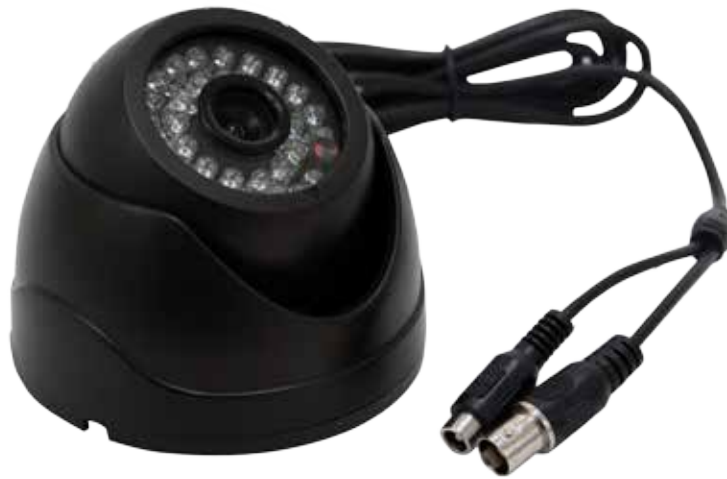
CMD420 CMD480 CMD520 CMD560 CMD600 & CMD700